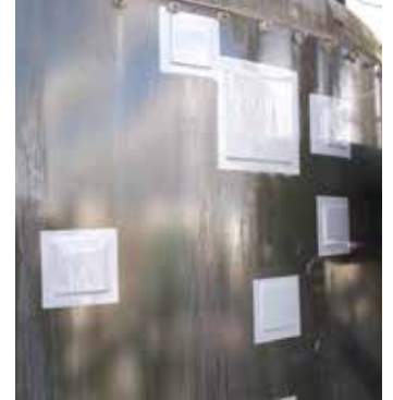
Cold plate bonding